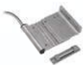
Roller Door Sensors