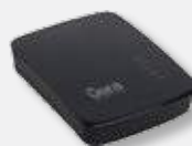
CON-VERAEDGE VeraEdge Home Controller