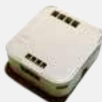
LIT-DWM-DHS Z-Wave In-Wall Dimmer Controller