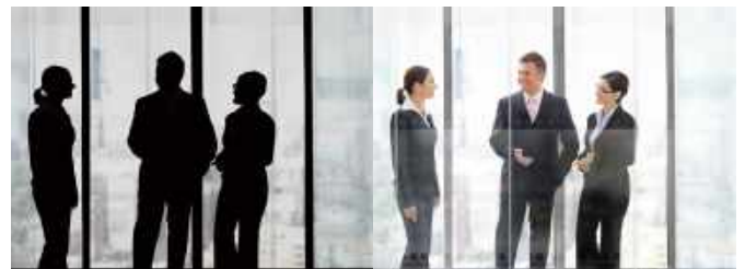
Without WDR Pro