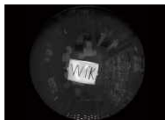
With Smart IR