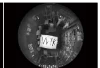
With Smart IR II (FE9391-EV)