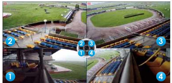
Multiple sensors, Adjustable views